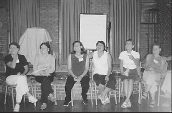
Top: HREP group in Van, Eastern Anatolia. Center and bottom: A workshop during HREP Trainer Training, Istanbul, 2002.