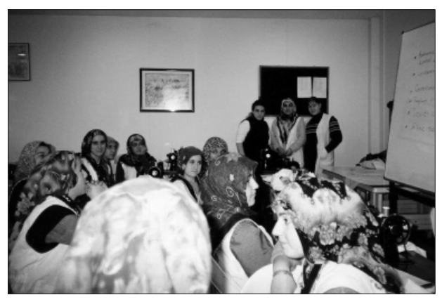
Top: HREP Evaluation and Grassroots Organizing Meeting with Trainers, 2003.

Bottom: Opening Ceremony of the Women's Counselling Center in Canakkale, founded by HREP participants after the program, 2002.